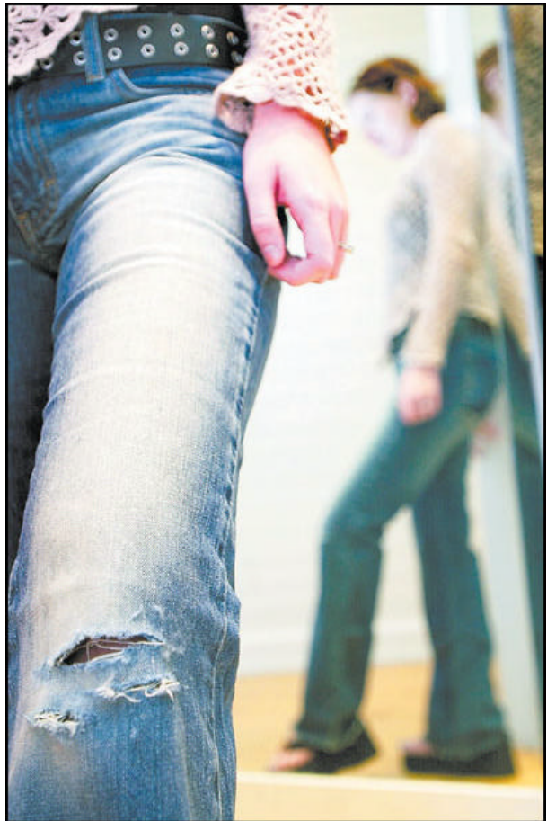
Blue jeans: more than just a pair of pants.

Work wear denims are in increasing demand among young men. Wal-Mart, Work Warehouse and Zellers will have the preferred brands in stock. Look for Wrangler, Lee and ... Levi's.